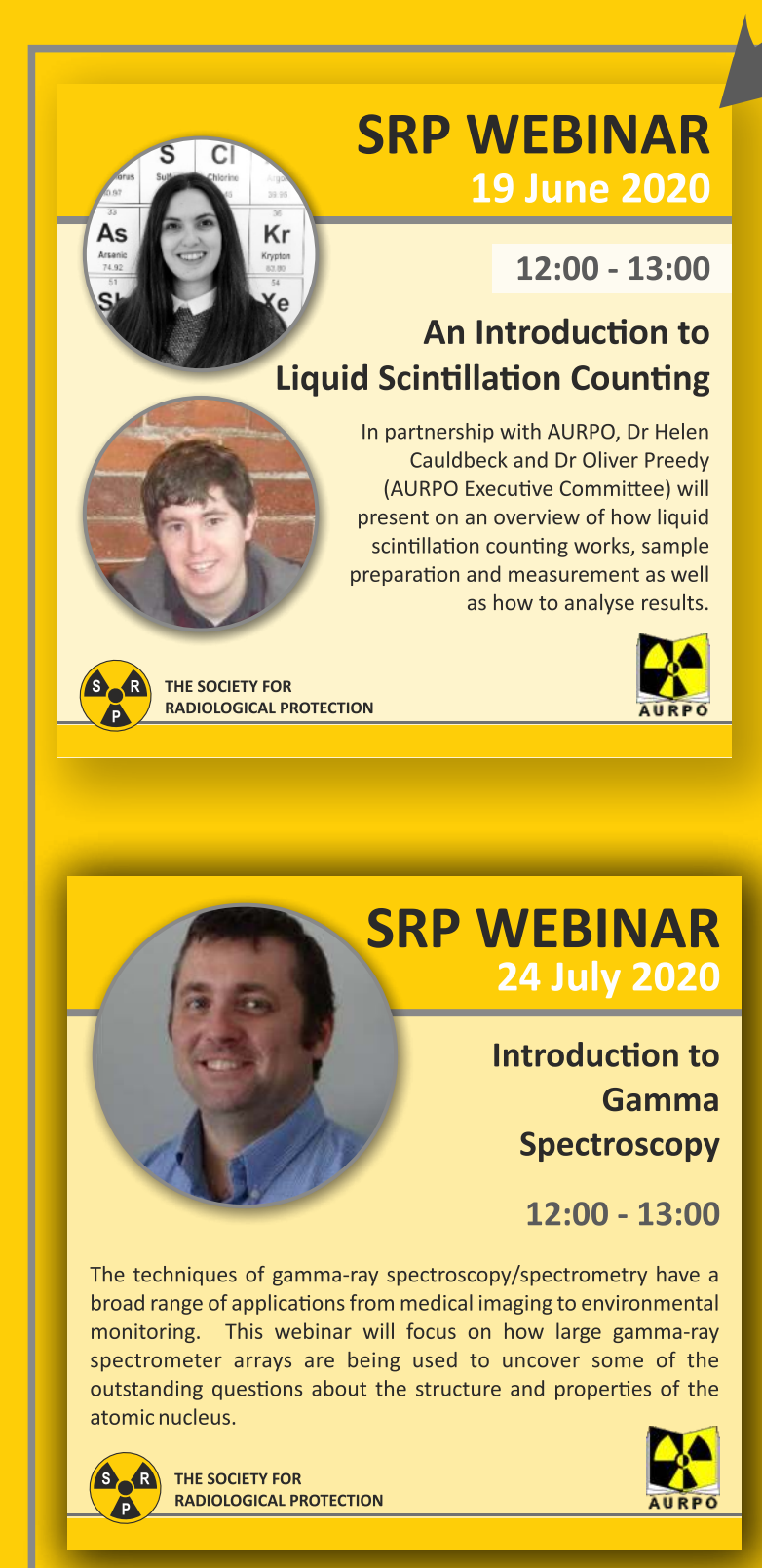
Figure 1 - Example Social Media Adverts for the SRP / AURPO Webinars

Whilst it is recognised that such webinars can't in themselves help to maintain practical competencies, in light of the successes to date and cost-effectiveness, it is intended for the programme to continue post-COVID restrictions and into the future "new normal" of the radiation protection / safety professional's working life.