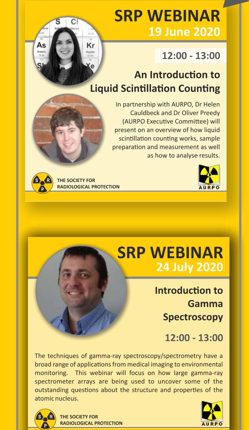
Figure 1 - Example Social Media Adverts for the SRP / AURPO Webinars

To date 11 webinars have been run broadly covering two cohorts, (a) those persons requiring introductory or refresher training on a certain subject and (b) those who wish for more advanced treatment of a specialised area.